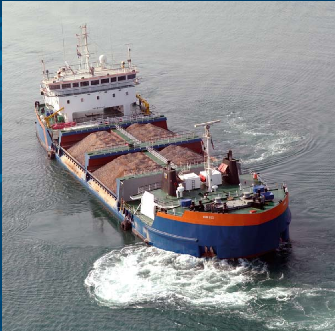
Side stone dumping vessel HAM 602