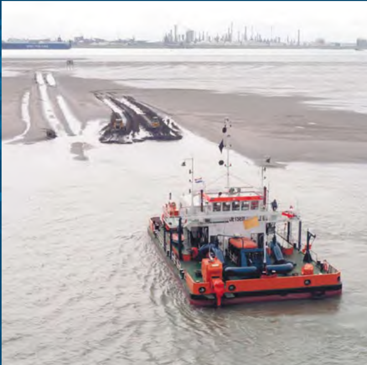
Water injection dredger Jetseid