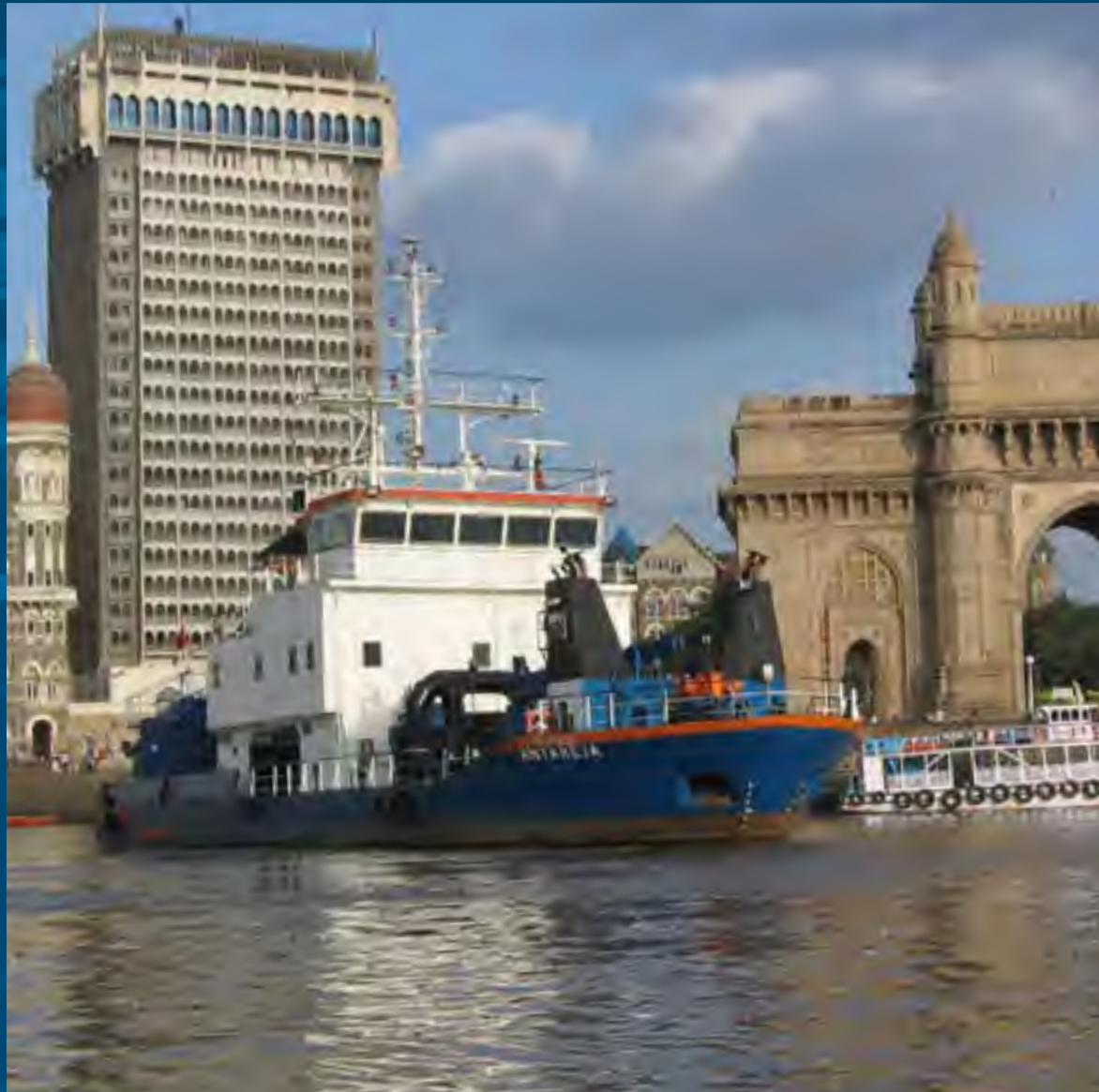
Water injection dredger Antareja