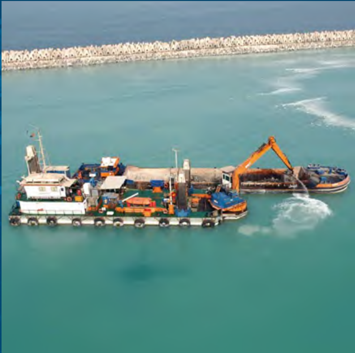
Backhoe dredger IJzeren Hein