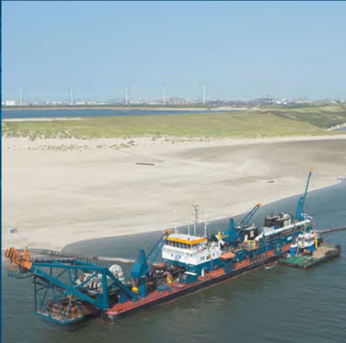
Suction dredger Sliedrecht 27