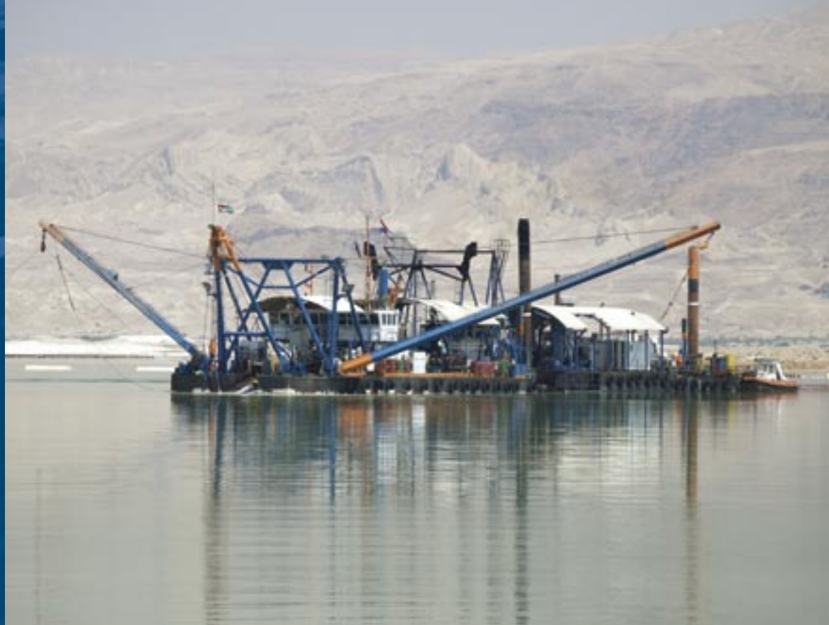
Cutter suction dredger (dismountable) Zeeland/Riekerpolder