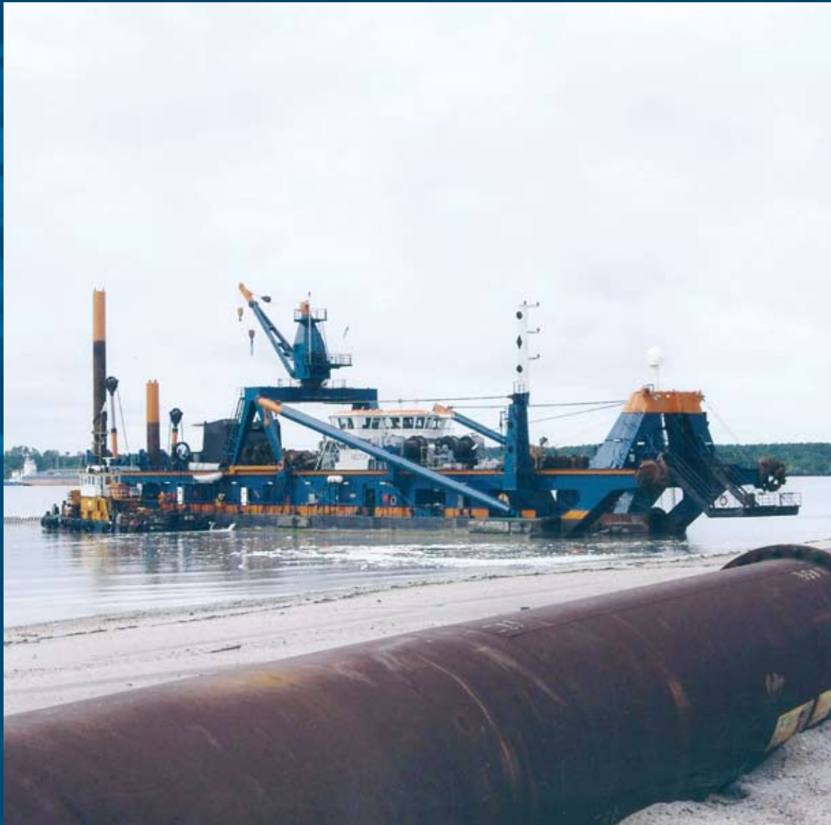
Cutter suction dredger Hector