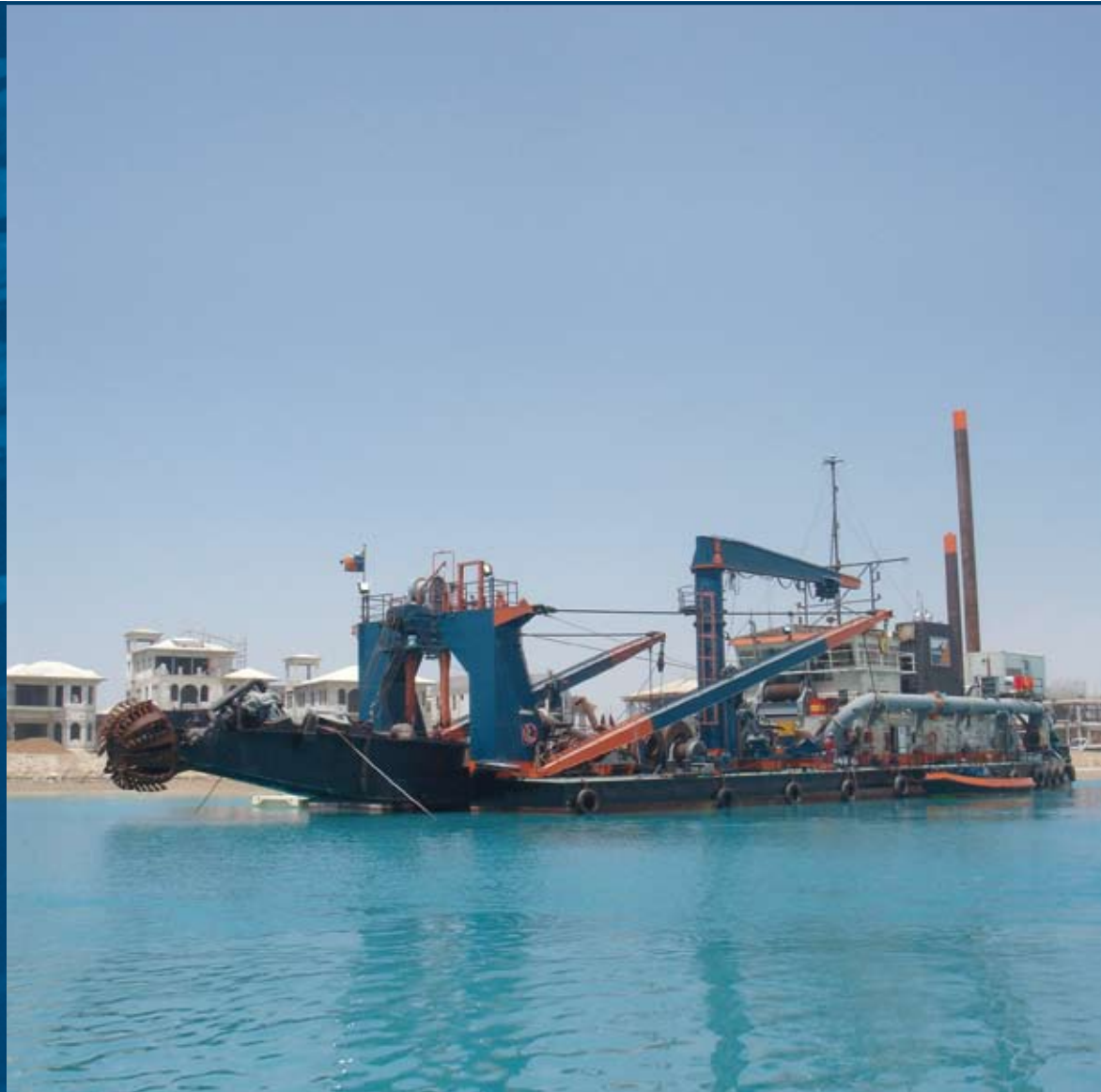
Cutter suction dredger HAM 219