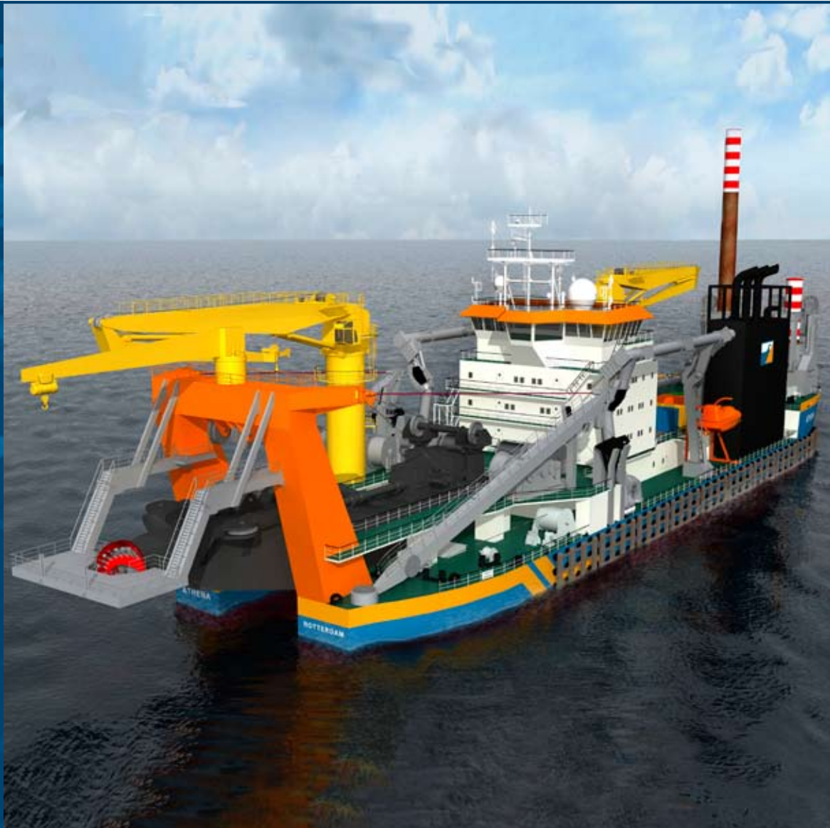
Self propelled cutter suction dredger Athena / Artemis