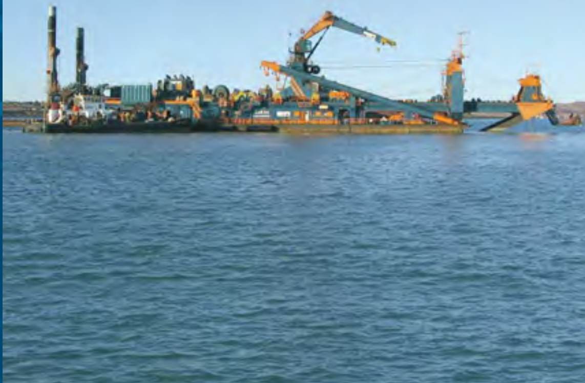
Cutter suction dredger HAM 218