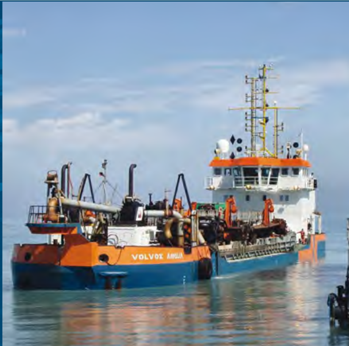
Trailing suction split hopper dredger Volvox Anglia