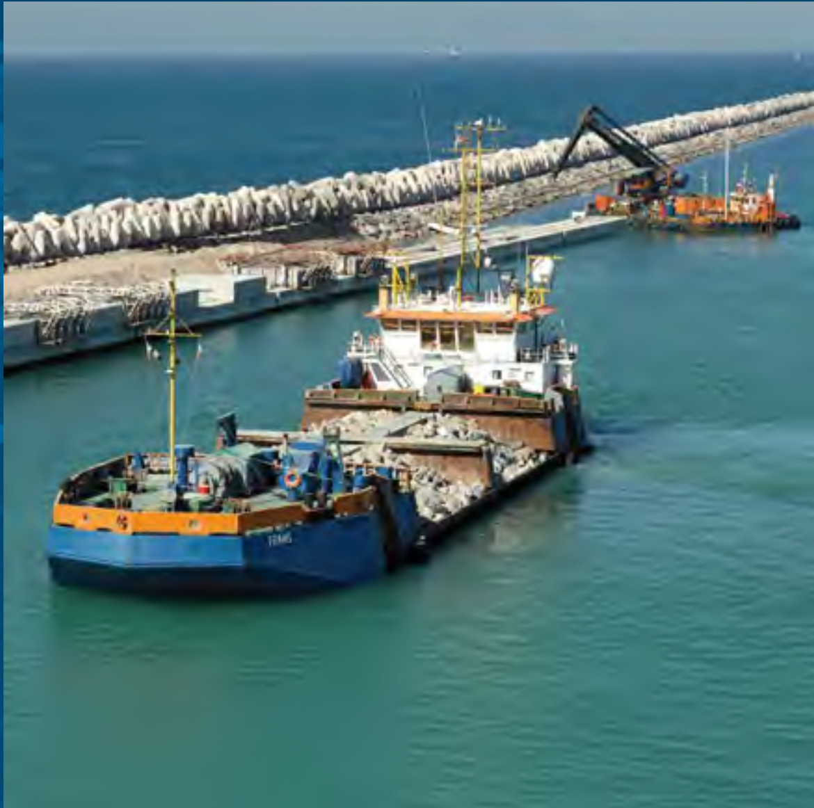
Side stone dumping vessel Frans