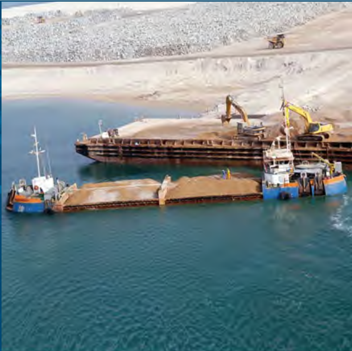
Side stone dumping vessel Avelingen