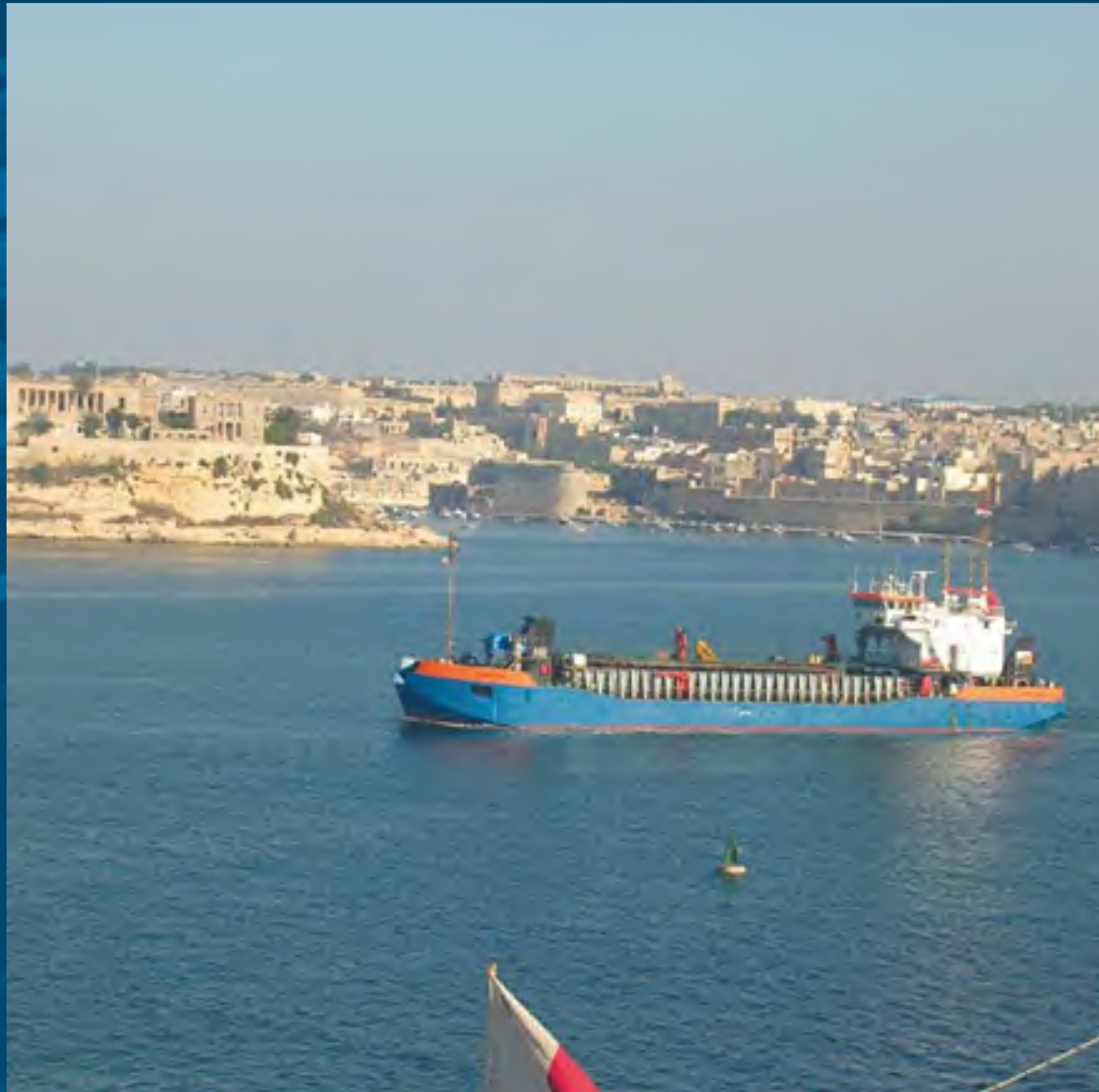
Split hopper barge HAM 350