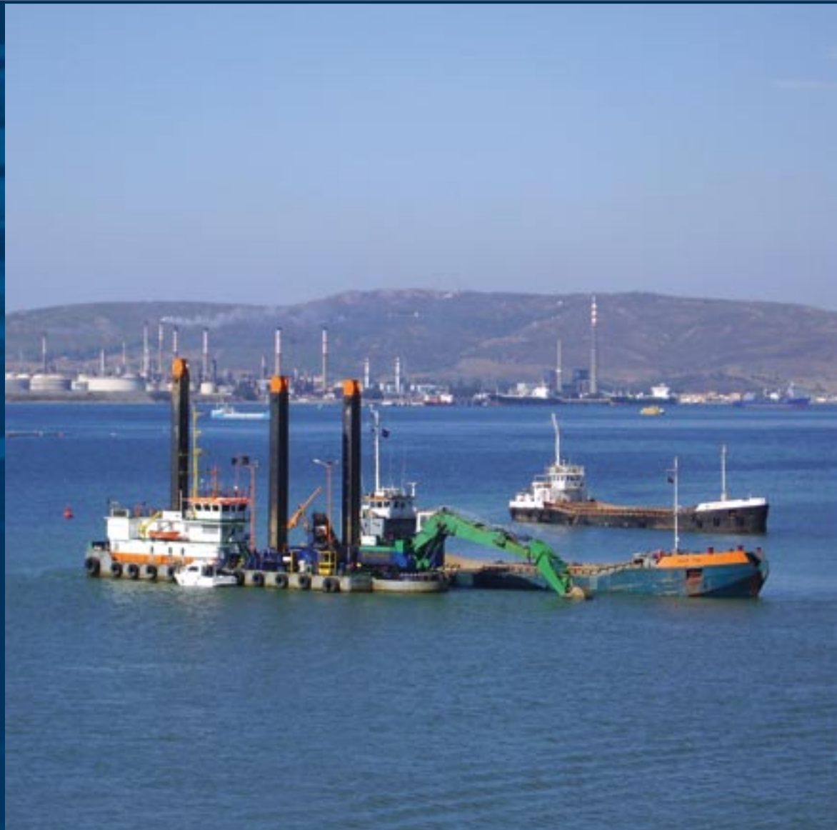
Backhoe dredger Razende Bol