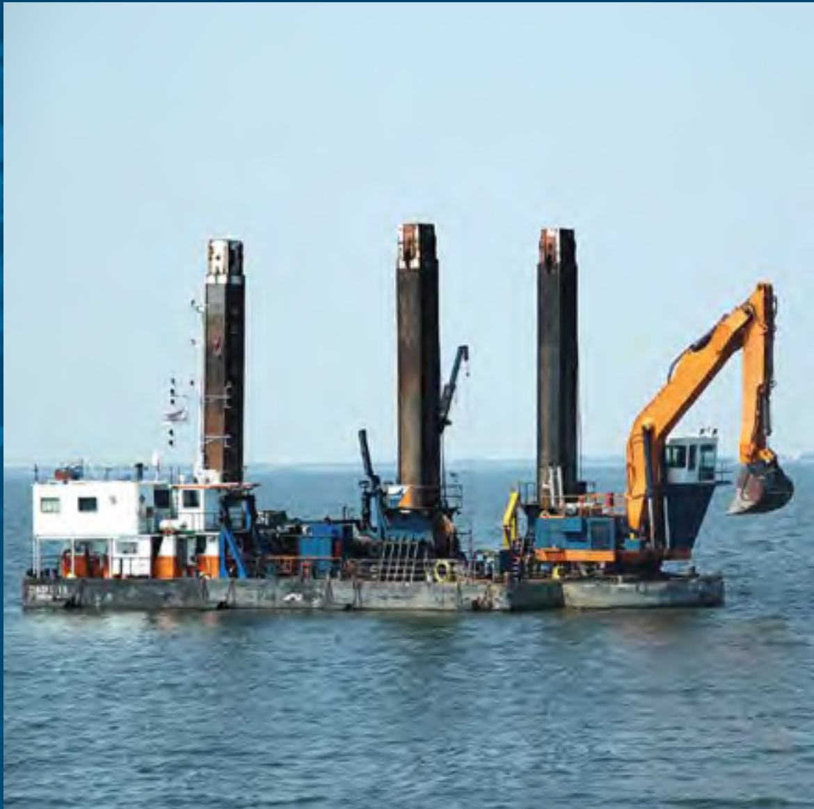
Backhoe dredger Dinopotes