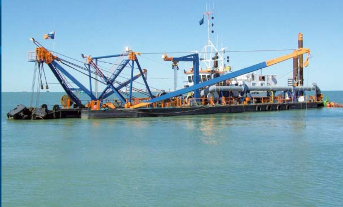
Cutter suction dredger Merwede