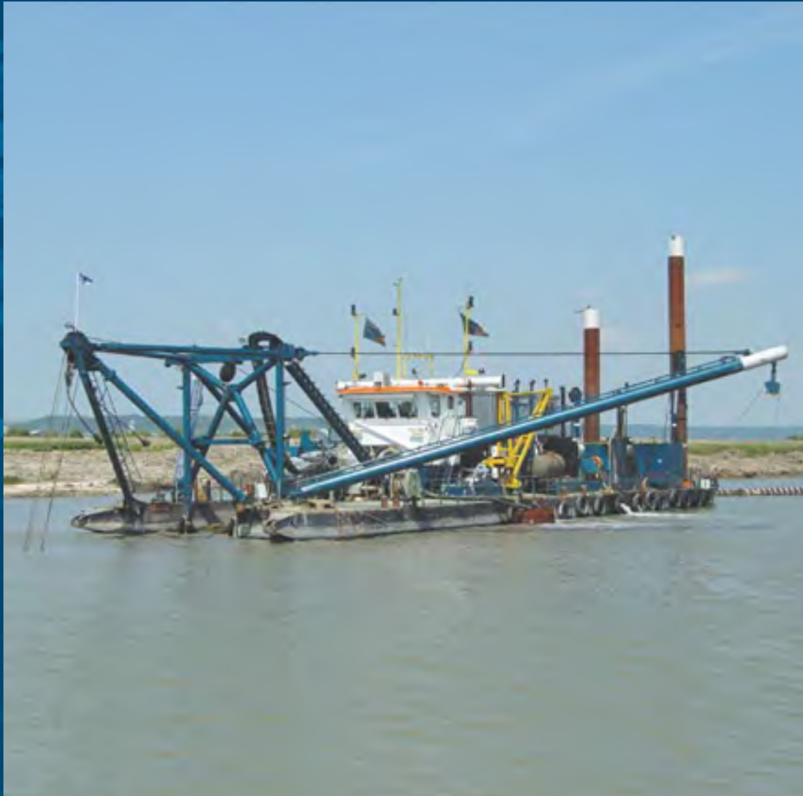
Cutter suction dredger Aegir