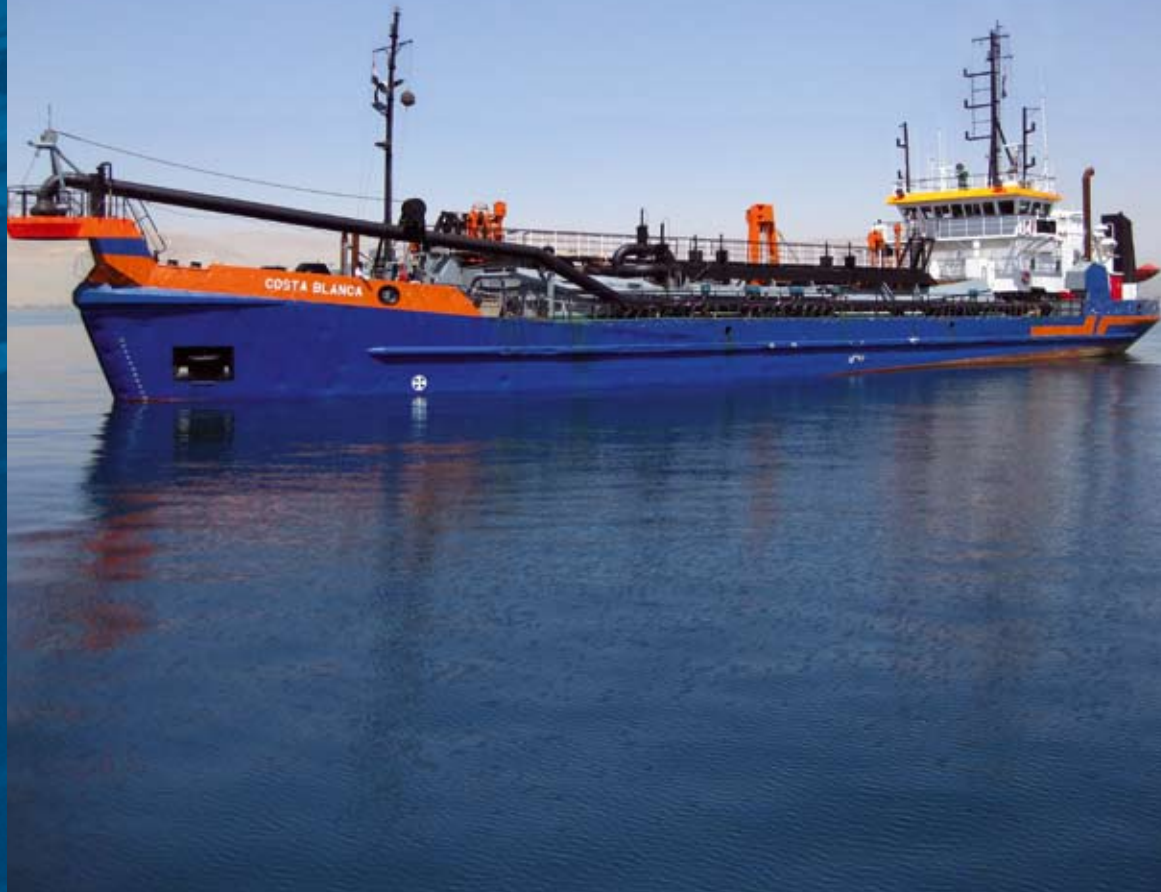
Trailing suction hopper dredger Costa Blanca